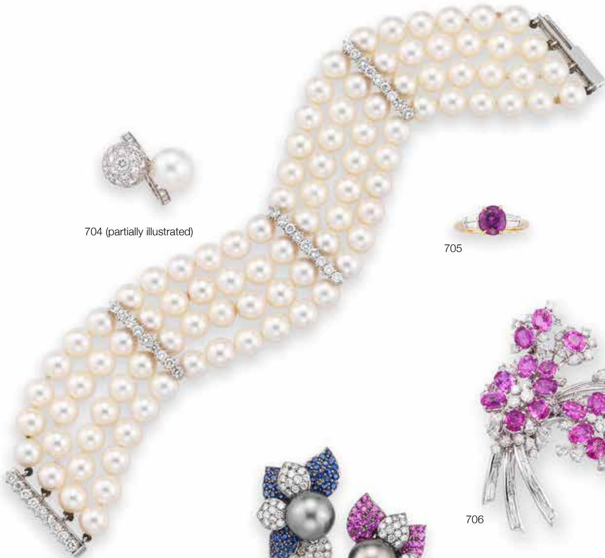
704 (partially illustrated)