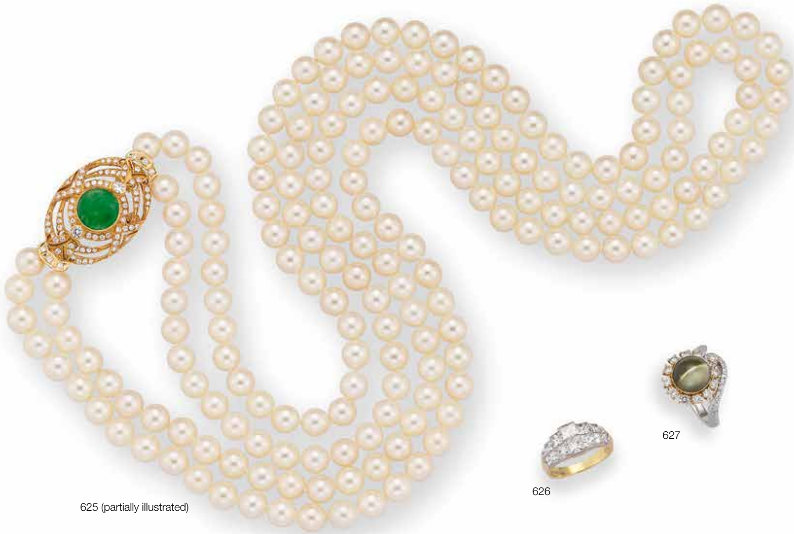
625 (partially illustrated)