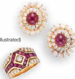
761 (partially illustrated)