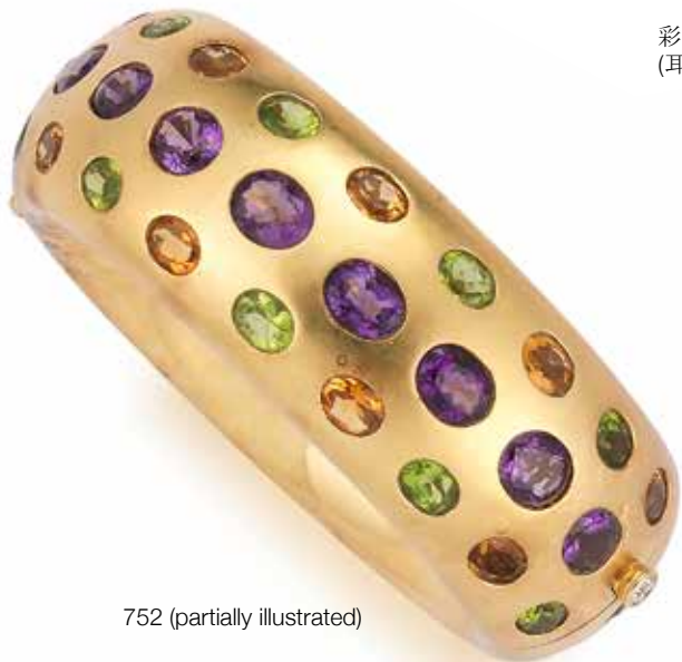
752 (partially illustrated)