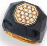
680 (partially illustrated)